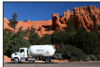
Who is your Propane Provider - Page 11 -