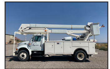
Surplus Items For Sale - Page 3 -