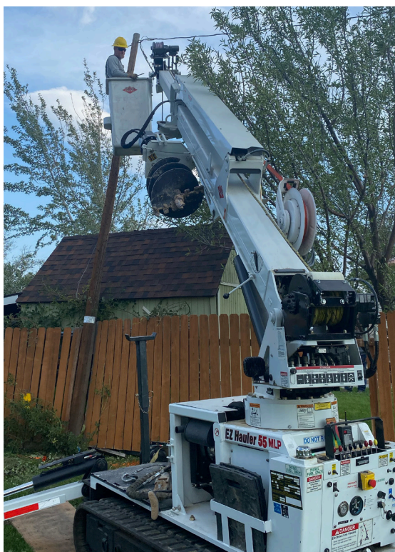
Mark Kabonic surveys the damage in a bucket truck, helping to restore power