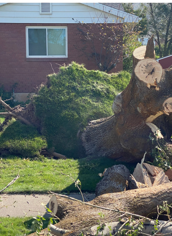
Destructive windstorm slams northern Utah, knocking over huge trees in Kaysville