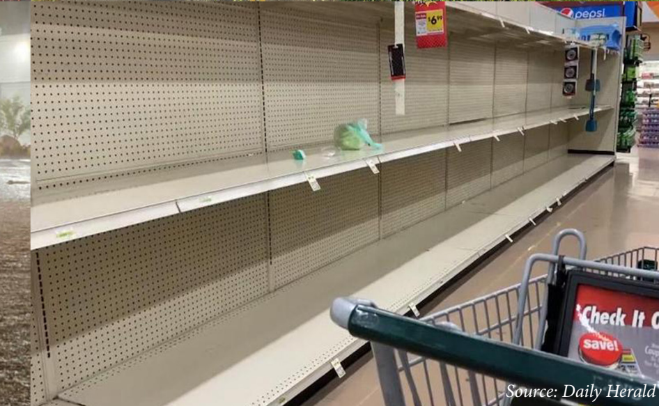
Top right (windstorm along the wasatch front, bottom right, food shortage due to Covid-19 Pandemic.