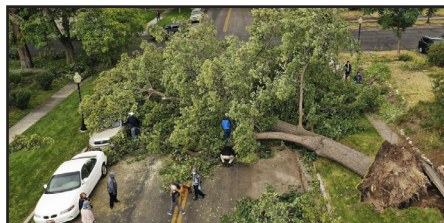
Garkane Crews Help Kaysville City - Page 5 -