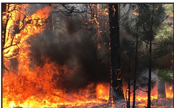
Are You Prepared? - Pg. 6 & 7 -