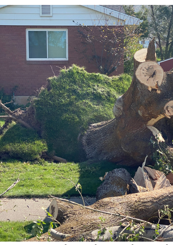
Destructive windstorm slams northern Utah, knocking over huge trees in Kaysville