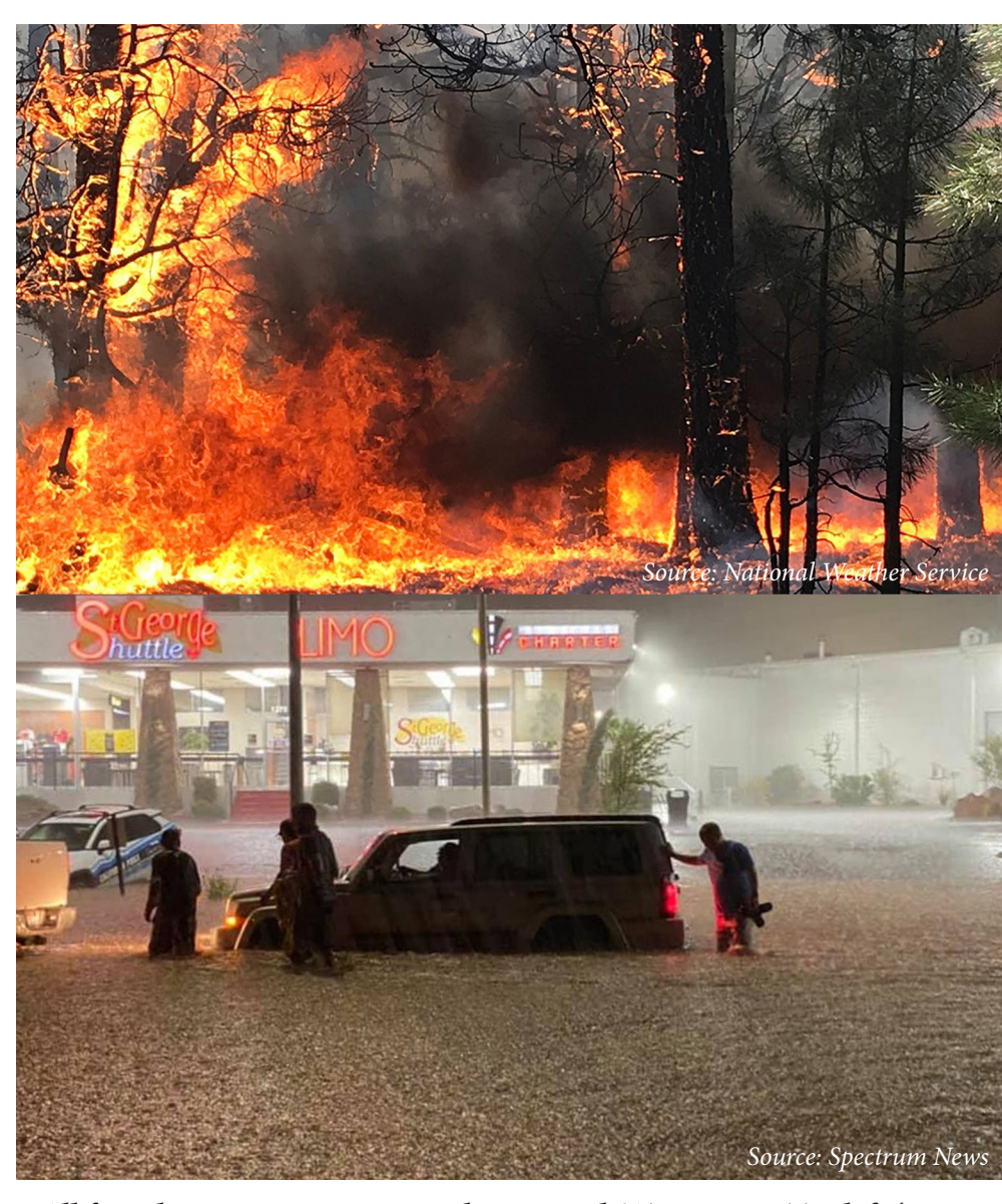
All four disaster pictures were taken in Utah/AZ in 2020. Top left (Mangum Fire on the Kaibab National Forest, bottom left (flooding in St George)

Determine how you will communicate with your family in case of an emergency. Creating a communication plan is important in case the normal text or mobile phones don't work. Know how you will reconnect if separated. Pick someone out of town that everyone should contact. Establish a family meeting place that is safe, familiar and accessible. Identify multiple evacuation routes in case the preferred path is blocked. Finally, put your family emergency plan in writing. (86700)