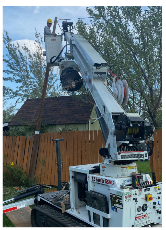
Mark Kabonic surveys the damage in a bucket truck, helping to restore power